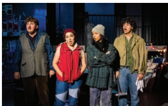
COLLEGE ACTING APPRENTICES IN RENT (2025)