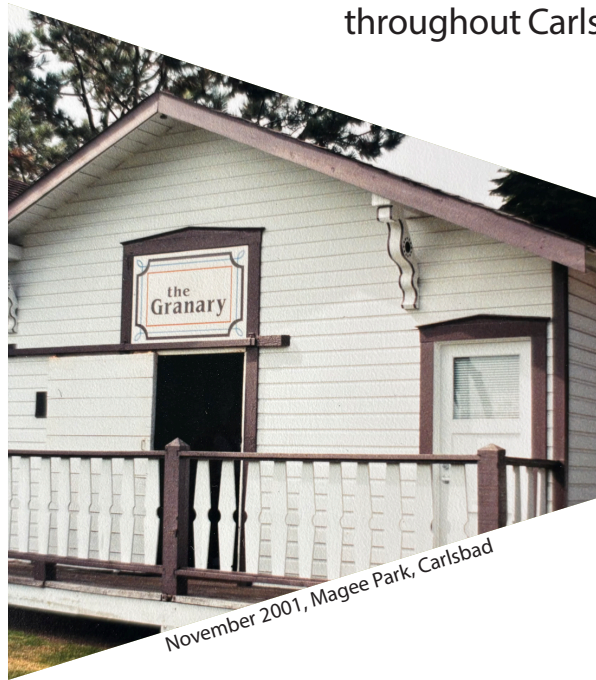
November 2001, Magee Park, Carlsbad

With nearly a quarter of a century of creating art, the history of New Village Arts is impressive. NVA started in a converted chicken coop (literally), moved over to the corporate headquarters of Jazzercise, and has spent the last 18 years in the heart of Carlsbad Village. Since first leasing the building from the City of Carlsbad at 2787 State Street in 2007, New Village Arts has continuously presented seasons of award-winning plays and musicals, attracting over 30,000 visitors per year to Carlsbad Village to not only discover wonderful theatre, but also to frequent nearby restaurants and shops. Through outreach and education programs NVA has brought the arts into the lives of youth and seniors throughout Carlsbad, enriching lives and creating a deep sense of community.