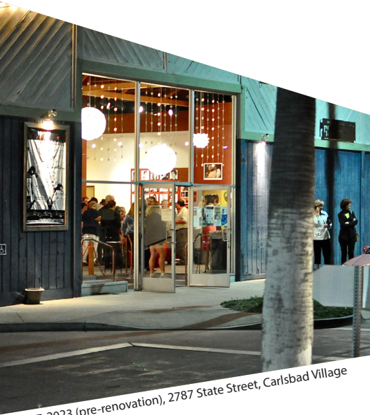
2007-2023 (pre-renovation), 2787 State Street, Carlsbad Village