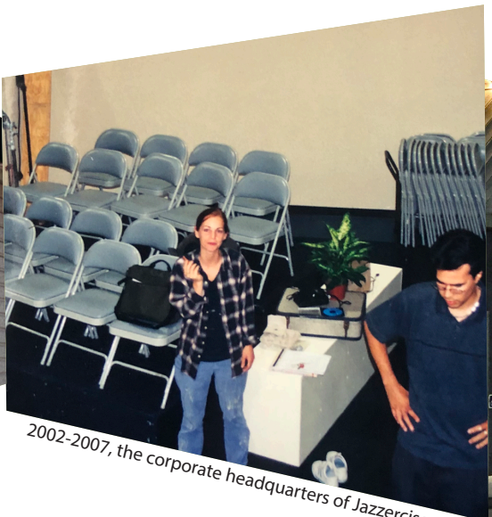
2002-2007, the corporate headquarters of Jazzercise, Inc.