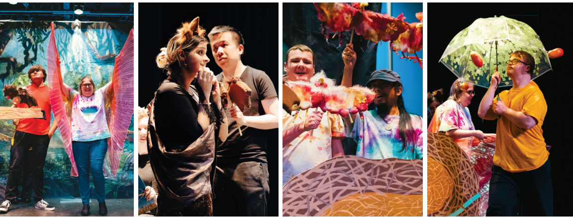
Photos are from NVA's school tour of Stellaluna

IT TAKES A VILLAGE! THANK YOU TO OUR GENEROUS ANNUAL FUND & COMPREHENSIVE CAMPAIGN DONORS