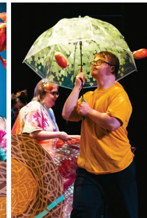
Photos are from NVA's school tour of Stellaluna