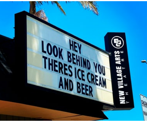
Left: Without shows to promote on the marquee, New Village Arts is using this signage as a way to connect with our community, and to celebrate the local businesses in our community (like Pure Project Brewing and Handel's Homemade Ice Cream across the street).