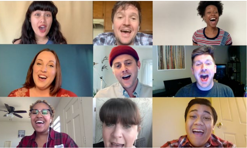
Above: The cast of NVA's AVENUE Q went digital to remind audiences that, although times are tough, these challenges are "Only For Now."